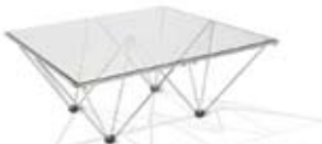
OTBRA080800CTP OH : 380mm OW: 800mm OD : 800mm