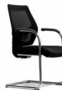
10. IX - 3M A P1 L1 XMBK F1AP