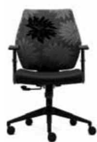
5. IX - 1M N SY P1 L1 YC FY01 F1AP