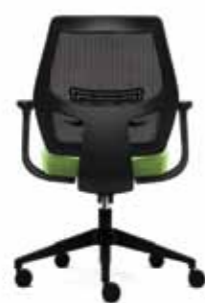
2. IX - 1M A SY P1 L1 YB XMBK F1AE