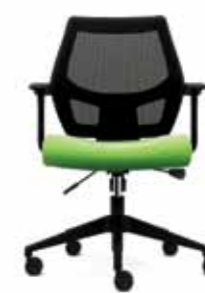
9. IX - 1M N DY P1 L1 YA XMBK F1AE