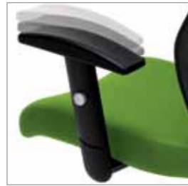
T shape with height adjustable armrest (YC)