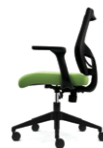
7. IX - 1M A DY P1 L1 YB XMBK F1AE