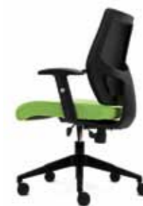
8. IX - 1M N DY P1 L1 YC XMBK F1AE