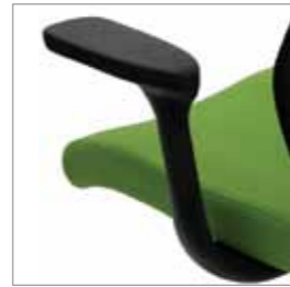
L shape fixed armrest (YB)