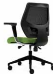
6. IX - 1M A DY P1 L1 YD XMBK F1AE