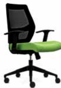
4. IX - 1M N SY P1 L1 YA XMBK F1AE