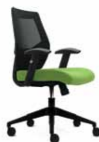
3. IX - 1M N SY P1 L1 YC XMBK F1AE