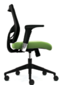
1. IX - 1M A SY P1 L1 YD XMBK F1AE