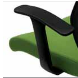
T shape fixed armrest (YA)