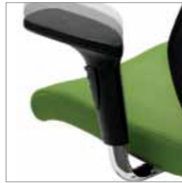
L shape with height adjustable armrest (YD)